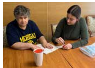
Personal care during Covid-19.

The Michigan Governor and State Senate extended the “Stay Home” order through April 30th, and it will be several weeks before things are back to normal. In the meantime, SLC will do everything it can to keep the residents safe.